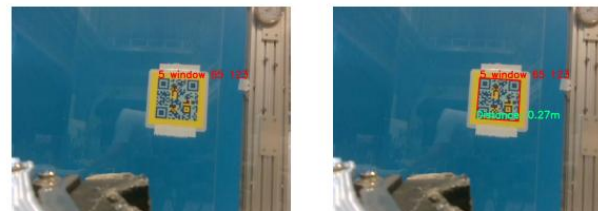
(a) Recognition of windows using the primary marker (b) Distance measurement using the secondary marker